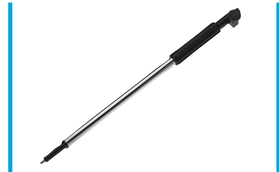
Model 224-010 Depth Extension

* We recommend using only one depth extension for vertical measurements.