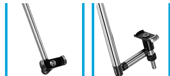
Special parallel version